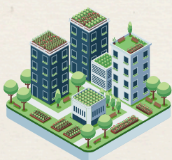
Urban planning and infrastructure development

This theme places housing at the centre of Africa's urban transformation agenda, recognizing it as both a social imperative and a strategic economic driver. It reflects the continent's shared commitment to inclusive growth, human dignity, resilience, and structural transformation, while responding directly to Africa's accelerating urbanization and the urgent need to deliver safe, affordable, and sustainable housing at scale. AUF2 will position housing not as a sectoral concern, but as a unifying platform through which cities can drive productivity, climate resilience, social cohesion, and long-term prosperity in line with Agenda 2063.