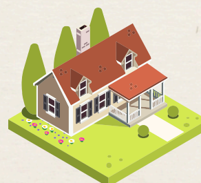
Transformation of informal settlements