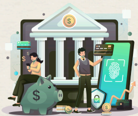
Innovative financing for Housing and Urban Development