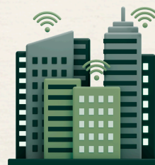
Smart cities, technology and innovation