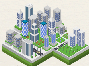
Urban resilience building and sustainable urban development