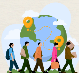
Urban displacement and migration